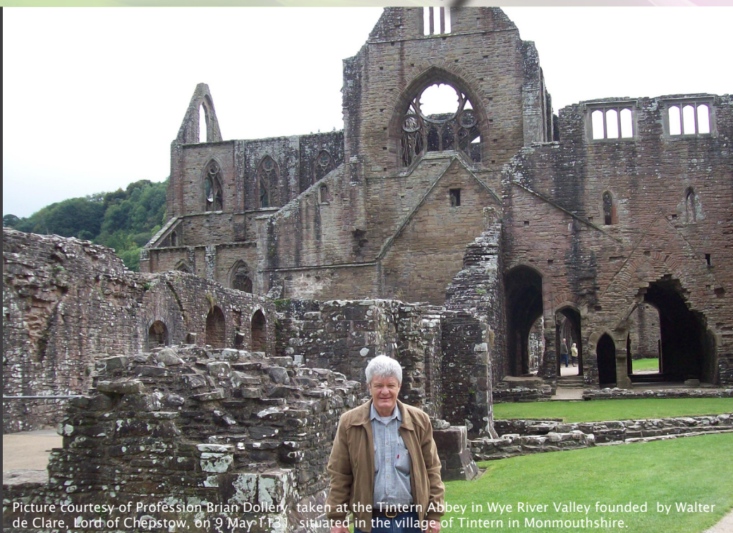
taken at the Tintern Abbey in Wye River Valley founded by Walter de Clare, Lord of Chepstow, on 9 May 1131, situated in the village of Tintern in Monmouthshire.