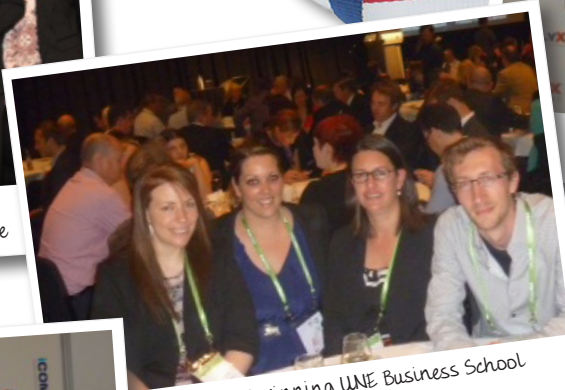
Award winning UNE Business School EDC Team