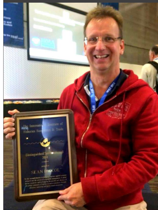
Former UNE Student received the IIFET 2014 Distinguished Service Award, read more on page 5