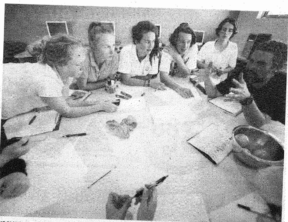
BIG PLANS: Bellingen High School's Big Idea 2013 crew planning today's youth music and skate event.

■ For details, go to www.facebook.com/herecom esthesun2013.