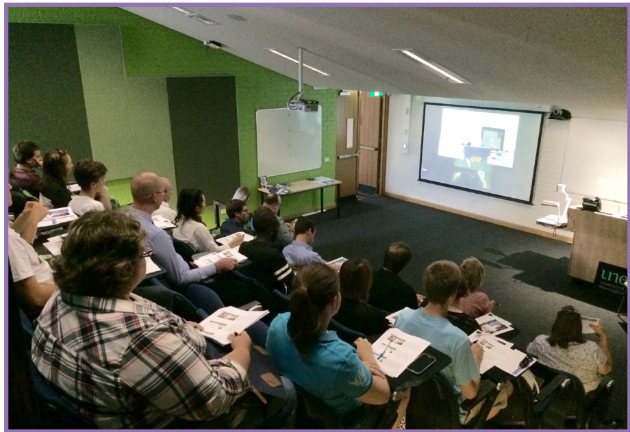
Right: Students at the SYGR event in Lecture Theatre 3, UNE Business School