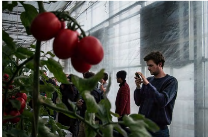
Photos taken during the 2014 UNE Business School China Study Tour