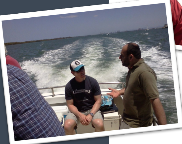
Right: Moreton Bay looking back at Surfers Paradise