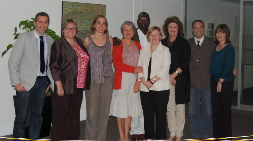
UWS Partners Meeting