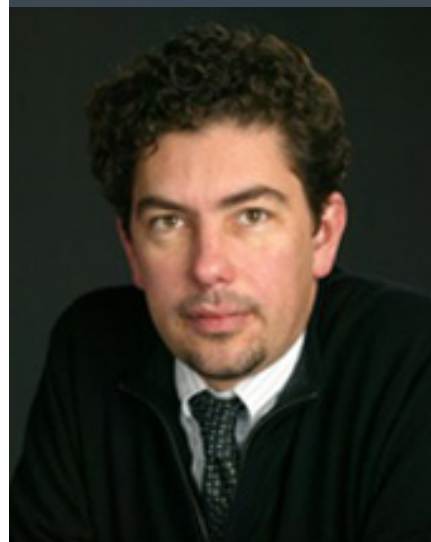
Bligh Grant Research Lecturer