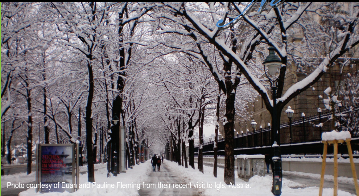
Photo courtesy of Euan and Pauline Fleming from their recent visit to Igls, Austria.