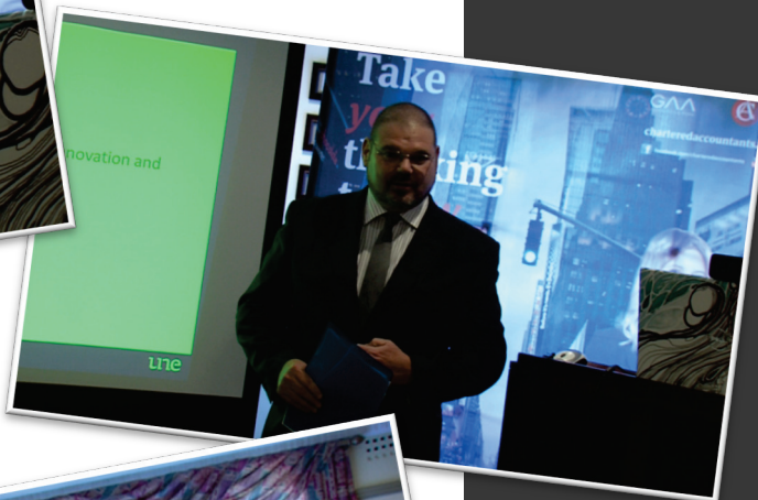
Pictured above (from left):