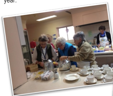
Above: CWA hard at work and provided the catering for the day