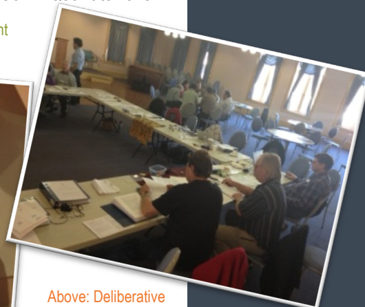
Above: Deliberative discussions