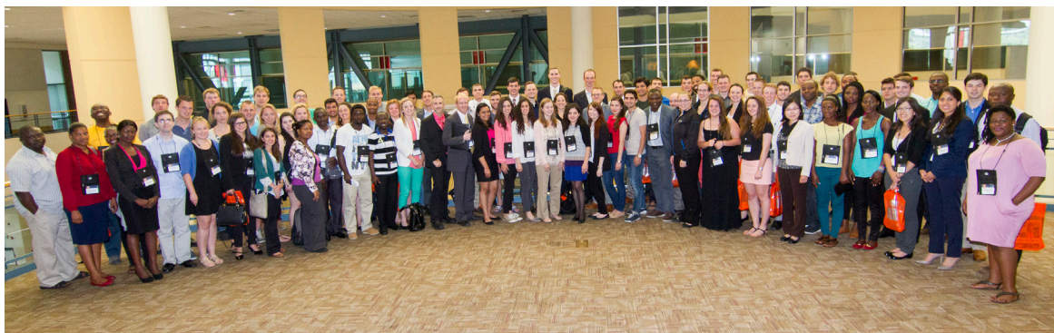
Conference participants from across the world gather in the Conference Centre in St Paul, USA