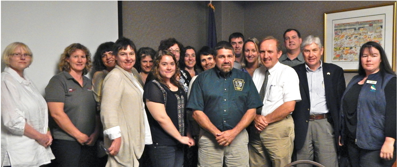
Participants in the Pennsylvania 'Leadership in Community Engagement' program, together with representatives of the USDA, Penn State University and collaborators.