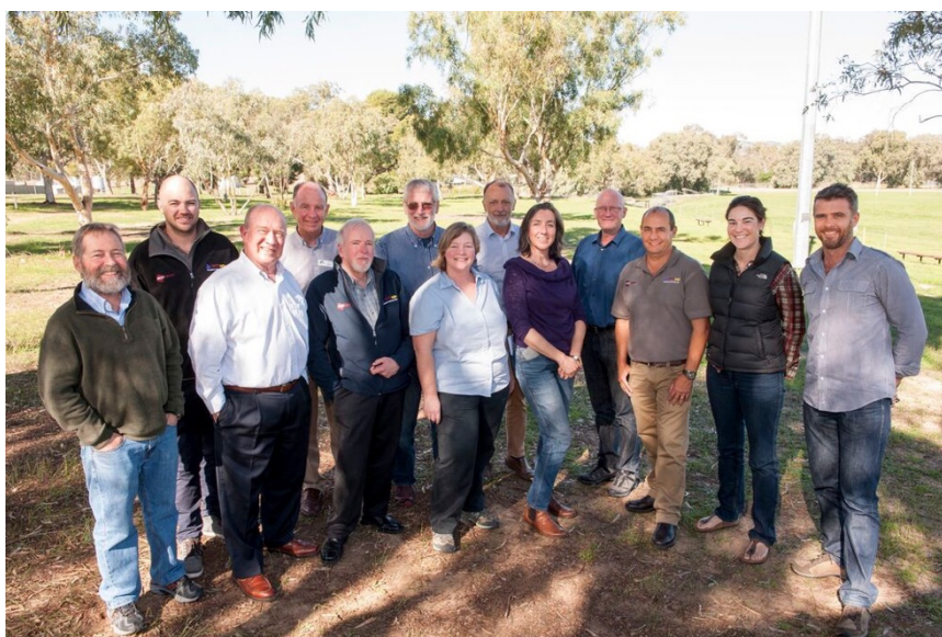
Convenors and attendees of Muresk Masterclass