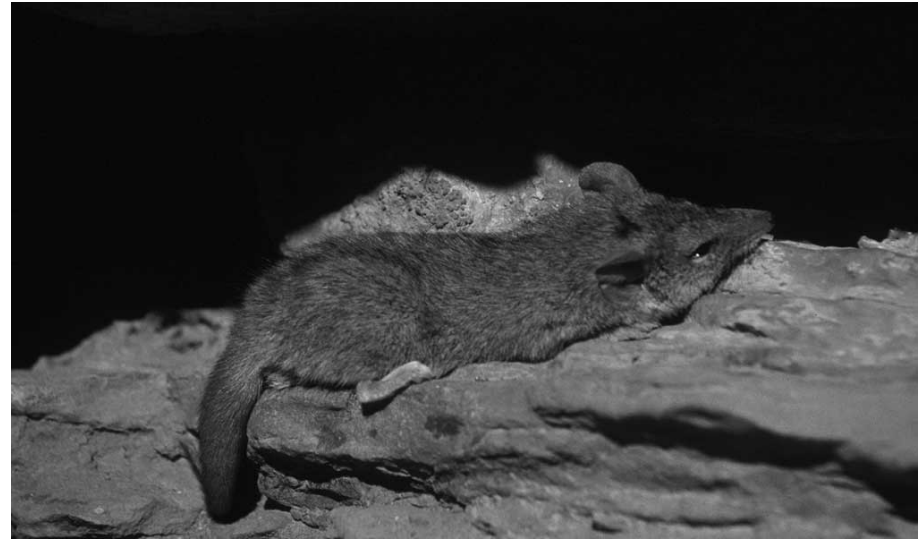
Fig. 2. A basking Pseudantechinus macdonnellensis.

(Geiser and Drury 2003). So with the low TMR, access to solar energy during passive rewarming from daily torpor, and access to solar energy during the normothermic rest phase allows a mammal like S. macroura to reduce daily energy expenditure by up to 50%. Thus, while the desert environment may be limiting with respect to food availability, the high T_a fluctuations and access to solar radiation provides another potential source of energy that is not commonly available to heterothermic species in cold climates with long and dark winters.