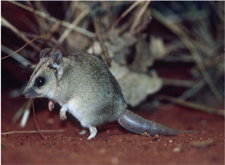
Fig. 1. A stripe-faced dunnart, Sminthopsis macroura .

was classified following McAllan et al. (1991). When exhibiting oestrus, each female was paired with a male for the duration of the oestrous period. Of the 12 individuals studied, two did not exhibit oestrous cycles during the reproductive season, two were paired with males at the time MR measurements were conducted, and the remaining eight exhibited oestrous cycles during the reproductive season and were paired with males prior to MR measurements. We did not know at the time of measurements whether or not the animals were pregnant; this was determined after the measurements during weekly assessment of reproductive condition. When not paired for mating, dunnarts were maintained individually in cages as described in Geiser et al. (1998) under the natural photoperiod of Armidale at an ambient temperature ( T_a ) of 20 °C. Cages were cleaned weekly when animals were weighed and reproductive condition assessed. To determine whether or not individuals entered torpor, the MR of each animal was