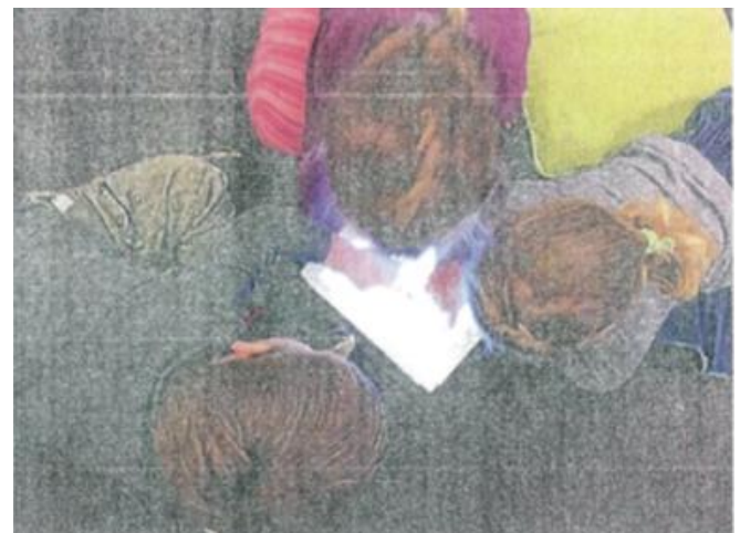
Figure 2: Picture from the diaries showing children working together

demonstrated in Figure 2, but they negotiated turn taking and self-timed their technology use.