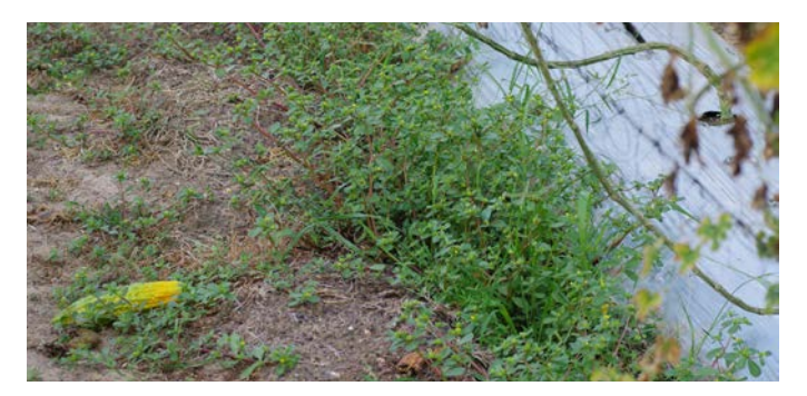
Figure 3 Rapid germination and early seed production, as well as the high number of seeds produced, make pigweed a significant competitor for vegetable crops and a rapid coloniser of bare disturbed soils.

Map 1 Australian distribution of pigweed