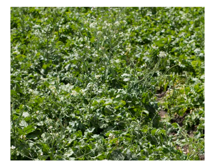
Figure 5 Rapidly establishing cover crops have been shown to be particularly effective in suppressing pigweed germination and growth due to their high biomass and dense canopy. Here, tillage radish (Raphanus sativus) was effective for managing a variety of broadleaf weed species on a farm near Hobart, Tasmania.

Because available light appears to be critical to pigweed germination, early-season cover crop canopy establishment and cover crop planting density are likely to be important factors in maximising shading and therefore restricting pigweed germination, growth and seed set.