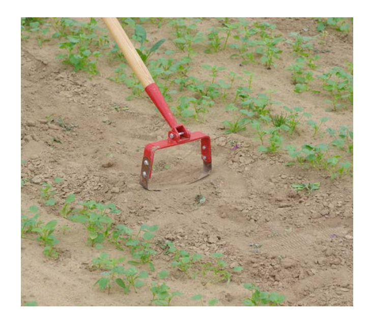
Figure 8 Removing recently germinated weeds such as pigweed before they have a chance to establish is an effective follow-up to pre-plant tillage and herbicide control, and will have longer-term benefits in reducing the weed seed bank. Tools that require relatively little effort, such as the stirrup hoe pictured here, can make this task easier depending on soil type and moisture level, and weed plant size. Larger pigweed plants are likely to require digging or pulling out, and removal of the entire plant to avoid re-rooting.

Farmers are generally hesitant to implement wide-scale hand weeding due to its high cost. However, selective hand weeding can be a very effective follow-up to tillage and herbicide control in particular, implemented earlier in the crop life cycle. Removing a few remaining pigweed plants by hand and taking plants away from the paddock may have significant benefits in reducing the weed seed bank in future crop seasons. It may also help prevent herbicide resistance from developing.