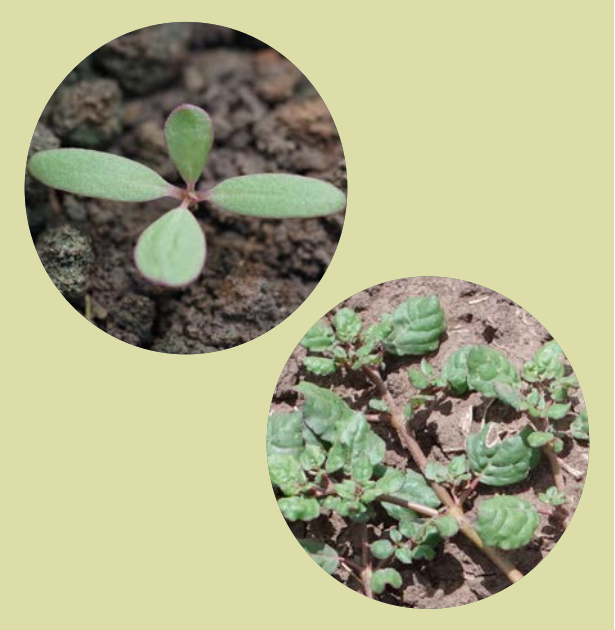
Figure 2 Giant pigweed seedling and mature plant.

Pigweed is also sometimes known as 'purslane'. It is a distinctive weed species and most vegetable farmers will be familiar with it, however it may be possible to confuse it with 'giant pigweed' ( Trianthema portulacastrum ), particularly soon after germination. Also known as black pigweed, this species is considered a native of tropical areas, and in Australia is largely found in the Northern Territory, Queensland, and northern New South Wales. As an adult plant, giant pigweed may be distinguished from pigweed by its more rounded, crinkled leaves and pink flowers.