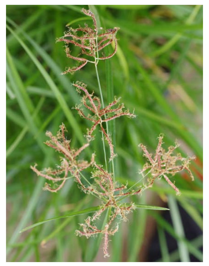
Figure 2 Nutgrass flower detail.