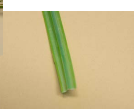
Figure 5 Close-up of nutgrass leaf, showing prominent vein on leaf underside.