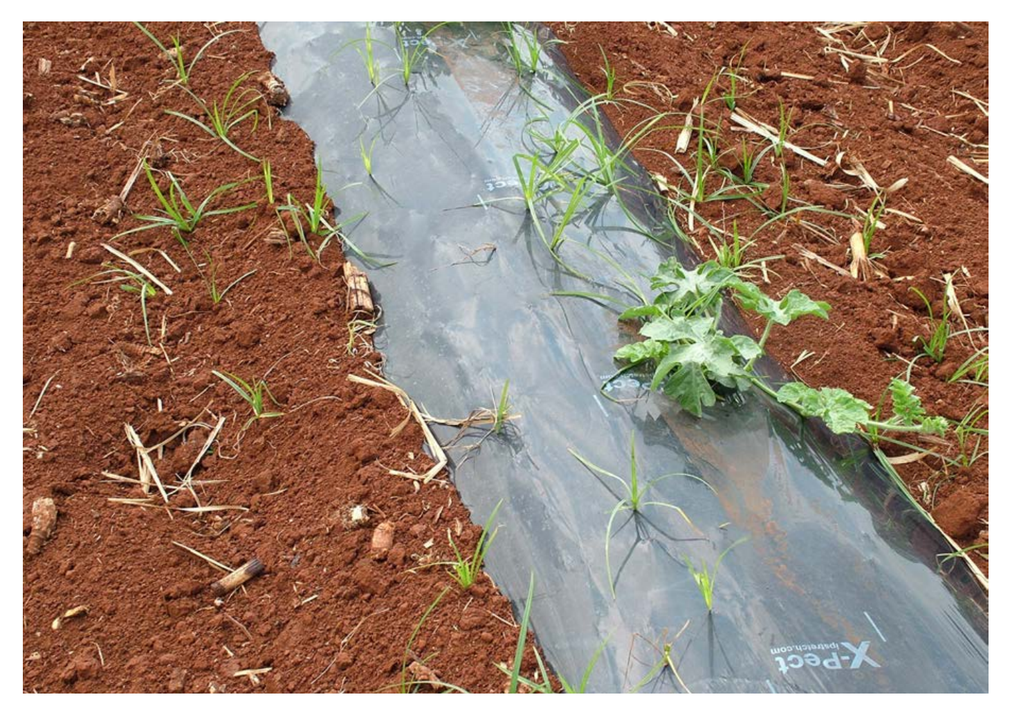
Figure 11 On this cucurbit crop near Bundaberg, Queensland, nutgrass readily pierced the plastic mulch film and caused significant in-crop and postharvest management issues.

Research also suggests that paper mulch alternatives (such as those coated with soy oil or linseed oil) may be more likely to resist piercing by nutgrass plants than black polyethylene mulches. However, there is a range of drawbacks using these paper mulches compared with plastic, including slower application times, higher initial costs, and variability in rate of degradation depending on soil and weather conditions. Biodegradable mulch films, for example made from corn starch, are increasingly available and may be suitable, though they have not been widely evaluated in vegetable crops.