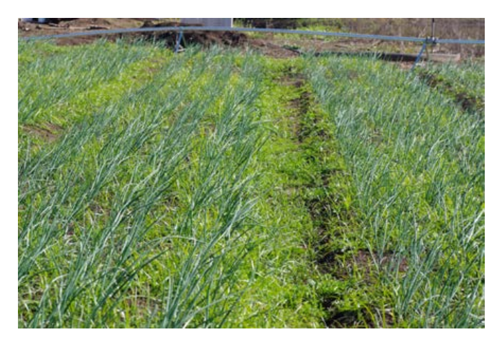
Figure 8 The significance of nutgrass in northern Australian vegetable growing regions is illustrated by this heavily infested onion crop near Gatton, Qld.