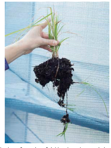
Figure 12 Establishing a fixed equipment wash-down bay can help restrict the spread of nutgrass on the farm, particularly where it is not present at all or only present on part of the farm.

Figure 13 The dense formation of viable tubers characteristic of nutgrass makes physical control impactical, particularly when tubers can easily break off when controlled by hand, giving rise to new nutgrass plants.