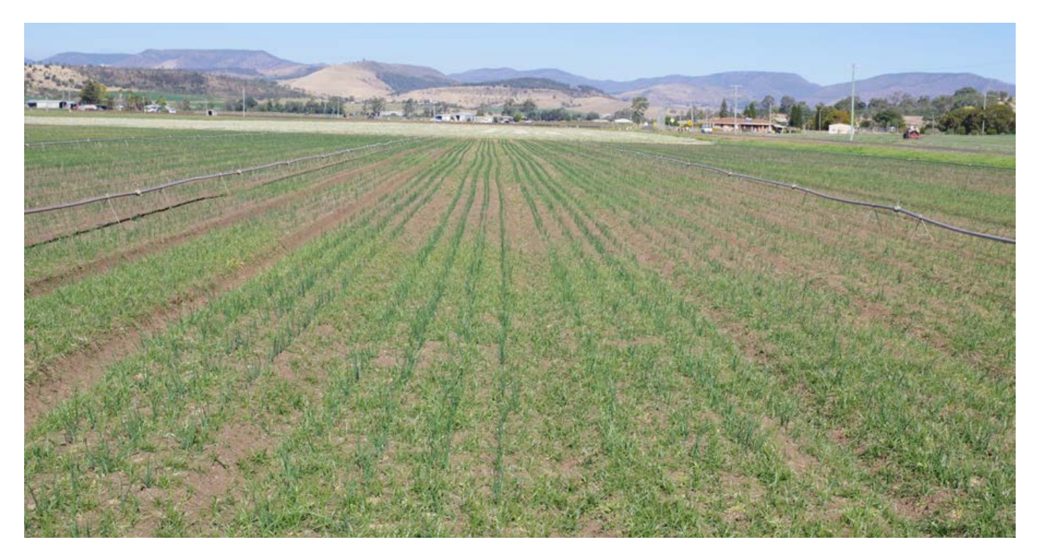
Figure 7 The high fertility soils and frequent tillage generally associated with vegetable production in Australia provide an ideal environment for the spread of nutgrass.

Other important methods of spread include soil transport (for example on tractor tyres), and flooding.