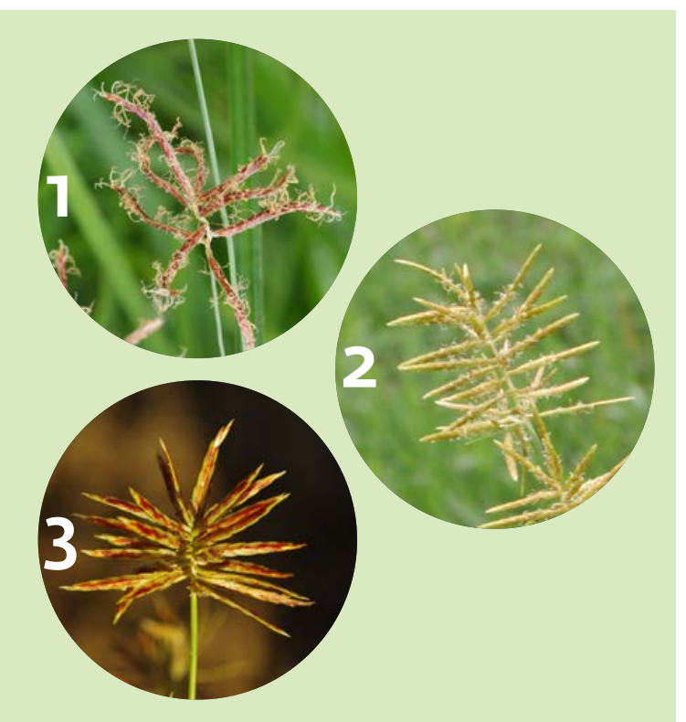
Figure 6 Comparison of flower head colours and form of: 1. Nutgrass C. rotundus (reddish-brown and umbrella shaped), 2. Yellow nutgrass C. esculentus (yellow-straw colour and bottlebrush shaped), and

Of the similar species, yellow nutgrass (C. esculentus) is the next most common in Australia. Yellow nutgrass is distinguished from nutgrass by its brighter green foliage, its yellow/straw-coloured flowers and the fact that tubers are found singly rather than being found in chains as is the case with nutgrass. Yellow nutgrass is also more likely to grow in cooler climate regions than nutgrass. It is most commonly troublesome in high-moisture soils in temperate irrigated regions, and can have a similar impact to nutgrass in Australia's temperate vegetable producing regions.