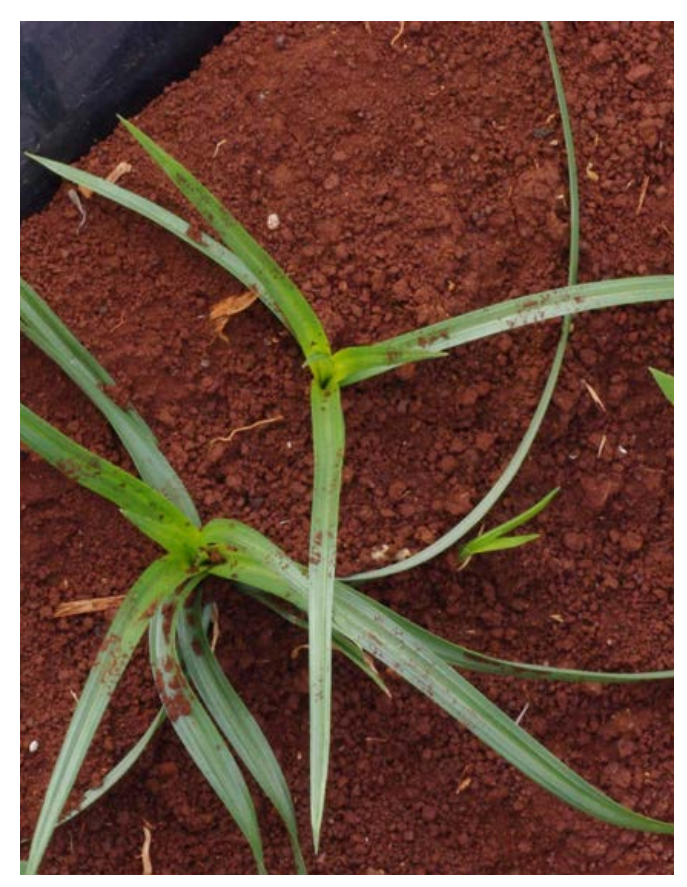
Figure 1 Nutgrass plants before flowering.

Individual plants form a basal bulb, mostly within 7-18 cm of the soil surface. This basal bulb contains the plant growing point. The fibrous root system can extend up to 1.2 metres below the soil surface. Because the growing point remains in the basal bulb, leaves can regrow easily after being severed at the soil surface.