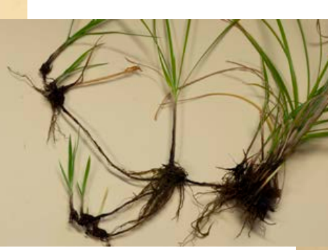
Figure 4 Nutgrass chain showing network of larger and smaller plants, rhizomes and tubers.