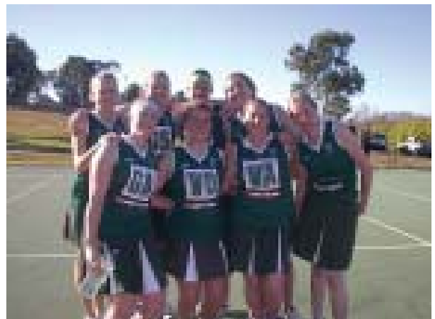
Netball Winning Team