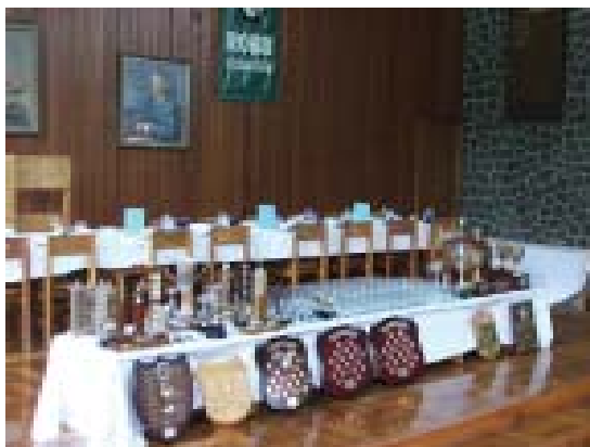
President's Changeover and Sports Awards Dinner