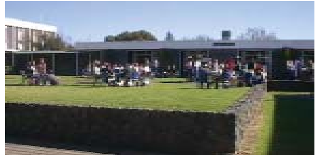
Breakfast on Lawn at Parent/Student Weekend