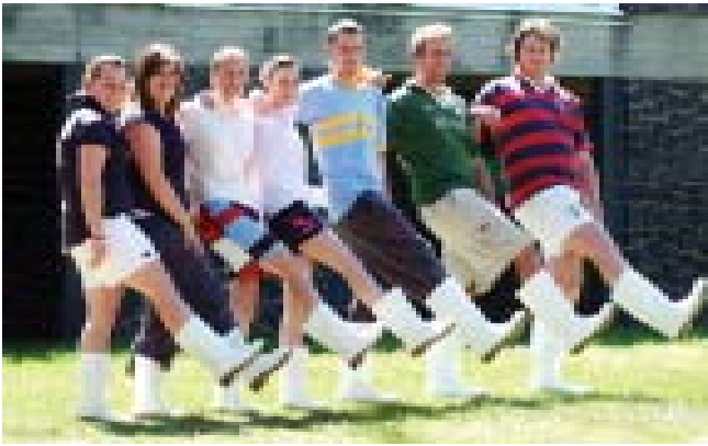
2005 Fundraiser for the Australian Red Cross (Armidale Express)