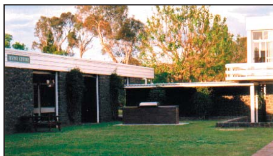
New Barbeque for Robb