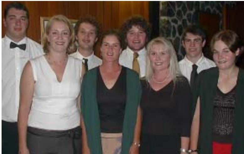
The Scholarship winners at the Introductory Dinner 2003