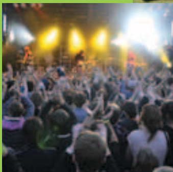
Life at Altitude, UNE Open Day 2011