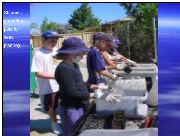
Students preparing pots for seed planting.