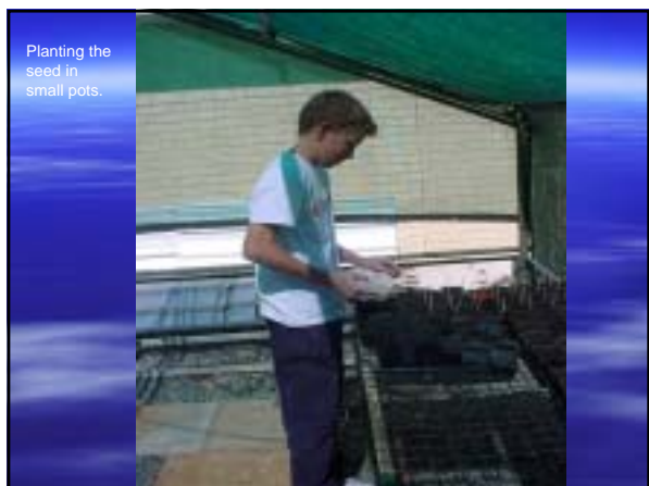
Planting the seed in small pots.