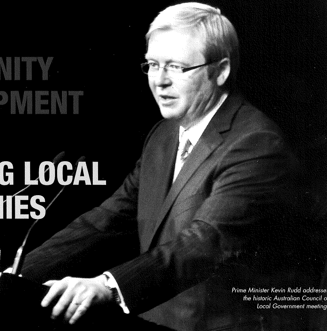
Prime Minister Kevin Rudd addresses the historic Australian Council of Local Government meeting.